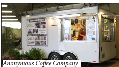
Anonymous Coffee Company

From high-end shops reminiscent of Fifth Avenue and Rodeo Drive to t-shirt and tack vendors, more than 50 specialty stores offer hours of shopping for one-of-a-kind equine related products, fine arts, gifts, accessories and more.