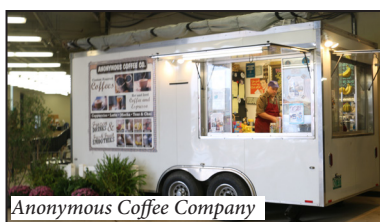
Anonymous Coffee Company