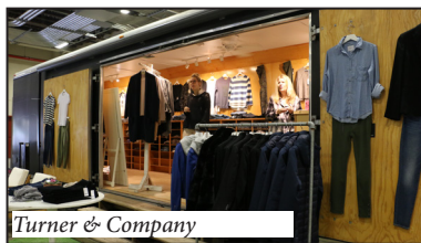
Turner & Company