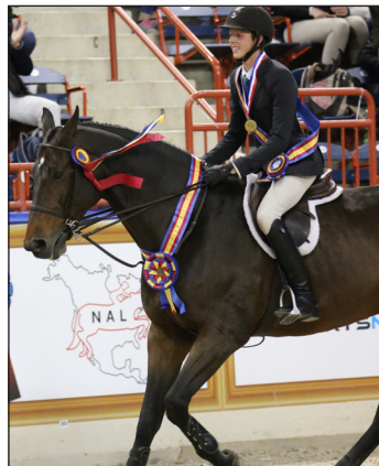
Medal Scenes