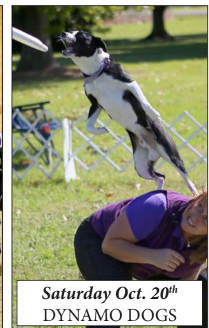
Saturday Oct. 20 th DYNAMO DOGS