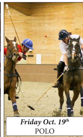
Friday Oct. 19 th POLO