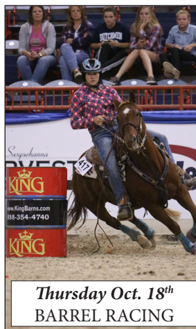
Thursday Oct. 18 th BARREL RACING