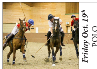
Friday Oct. 19 th POLO