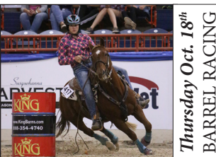
Thursday Oct. 18 th BARREL RACING

The NAL qualifying period runs September 1 through August 31. NAL competitions are open to all who wish to compete, however points are only awarded to current members. For more information regarding the North American League, please call (717) 867-5643, email to NAL@Ryegate.com or visit www.ryegate.com .