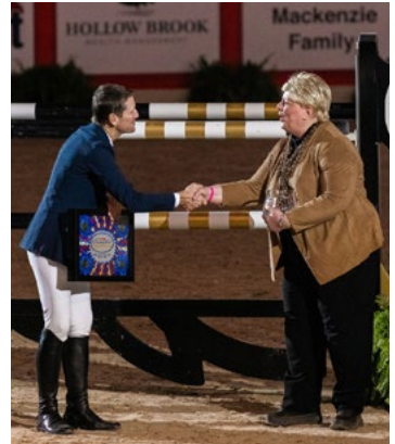
Hall of Fame '23: McLain Ward